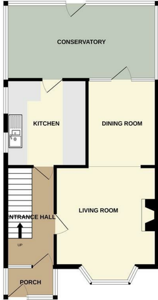
GROUND FLOOR 646 sq.ft. (60.0 sq.m.) approx.