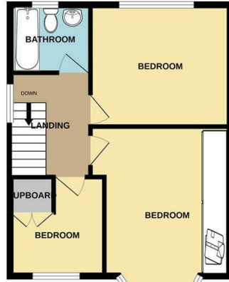
1ST FLOOR 450 sq.ft. (41.8 sq.m.) approx.